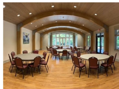
NEW HALL (ANNEX)